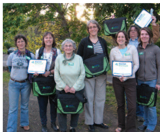
Spring 2010 class of Master Recyclers

Their volunteer activities have included helping with waste reduction and recycling at schools, on-the-job and in child day care facilities; staffing booths at local farmers markets; marching in local parades; litter clean-ups; helping with a medical waste